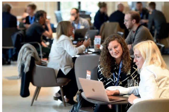
»Animation Production Day«