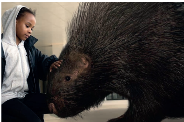
»Totem« von Sander Burger