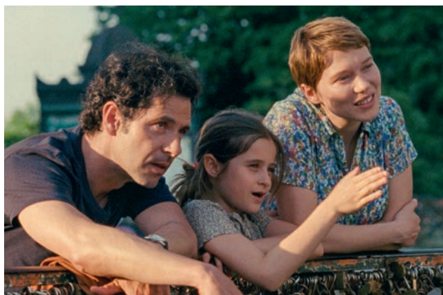
»An einem schönen Morgen« von Mia Hansen-Løve