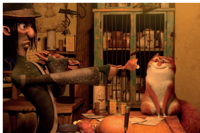
»Maurice der Kater«