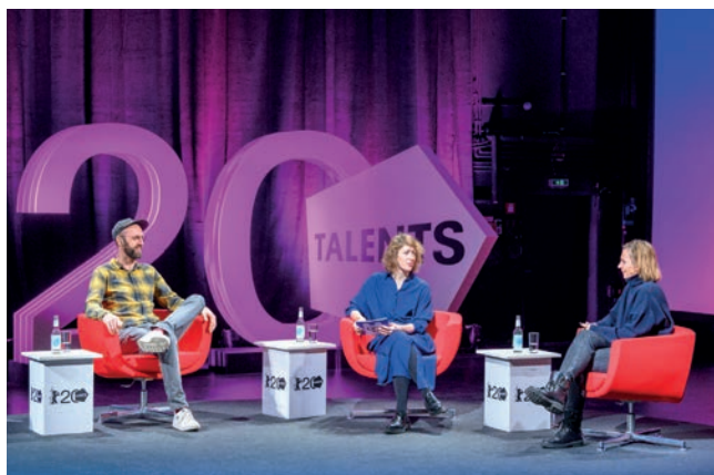
»Crowd Pleaser How to Work with Extras«