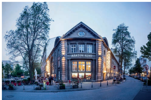
Abaton Kino Hamburg