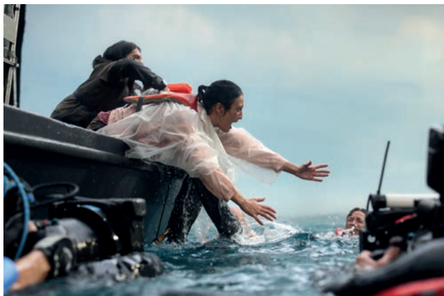
»Der Schwarm Making Of #DerSchwarmKommt«