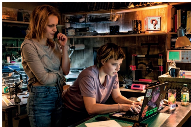
»A thin line«