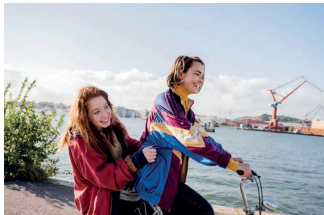
»So damn easy going«