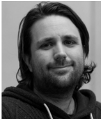
Johan Fasting Norway | writer, showrunner (»Makta / Power Play«)