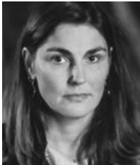
Sanne Nuyens Belgium | writer, showrunner »Hotel Beau Séjour«, »The Twelve«