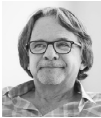
Frank Spotnitz USA/UK | writer, showrunner, executive producer »The X-Files«, »The Man in the High Castle«, »Leonardo«