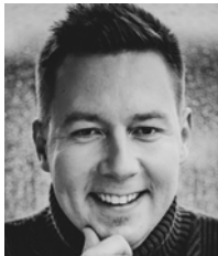
Wiktor Piątkowski Poland | writer, producer, showrunner »Morderczynie / Murderesses«, »Wataha / The Pack«